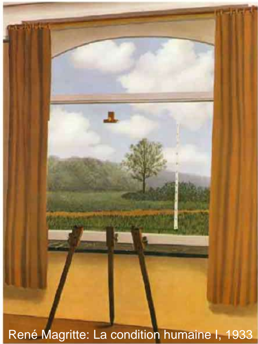
René Magritte: La condition humaine I, 1933